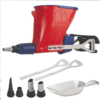
Pointing Guns and Adapter Kits