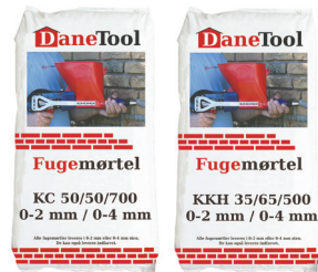
Pumpable Mortars (KKH, KC, M5)