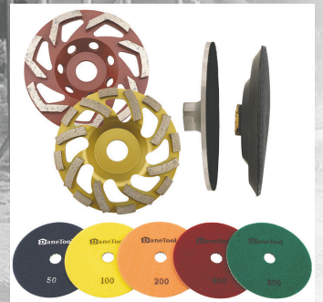
Grinding and Surface Preparation