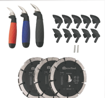
Complete Masonry Tool Kits