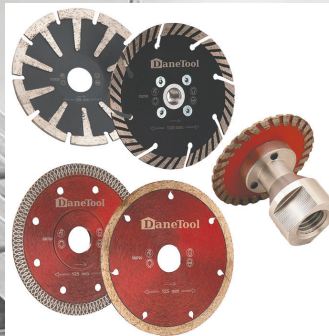
Diamond Blades & Cutting Tools