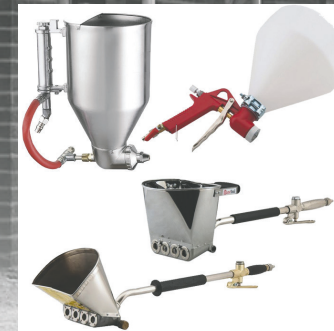
Grouting and Spraying Equipment