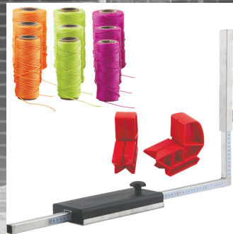
Masonry Alignment Tools