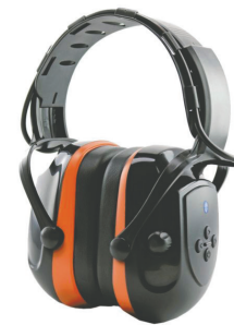
PPE and Site Safety Equipment