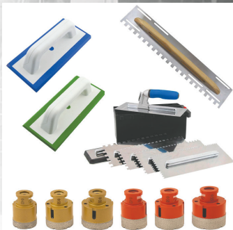
Full Range of Tiling Tools