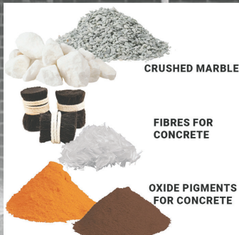
Aggregates and Colour Additives